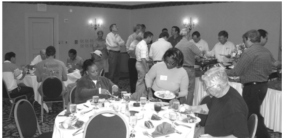
Spring 06 Luncheon